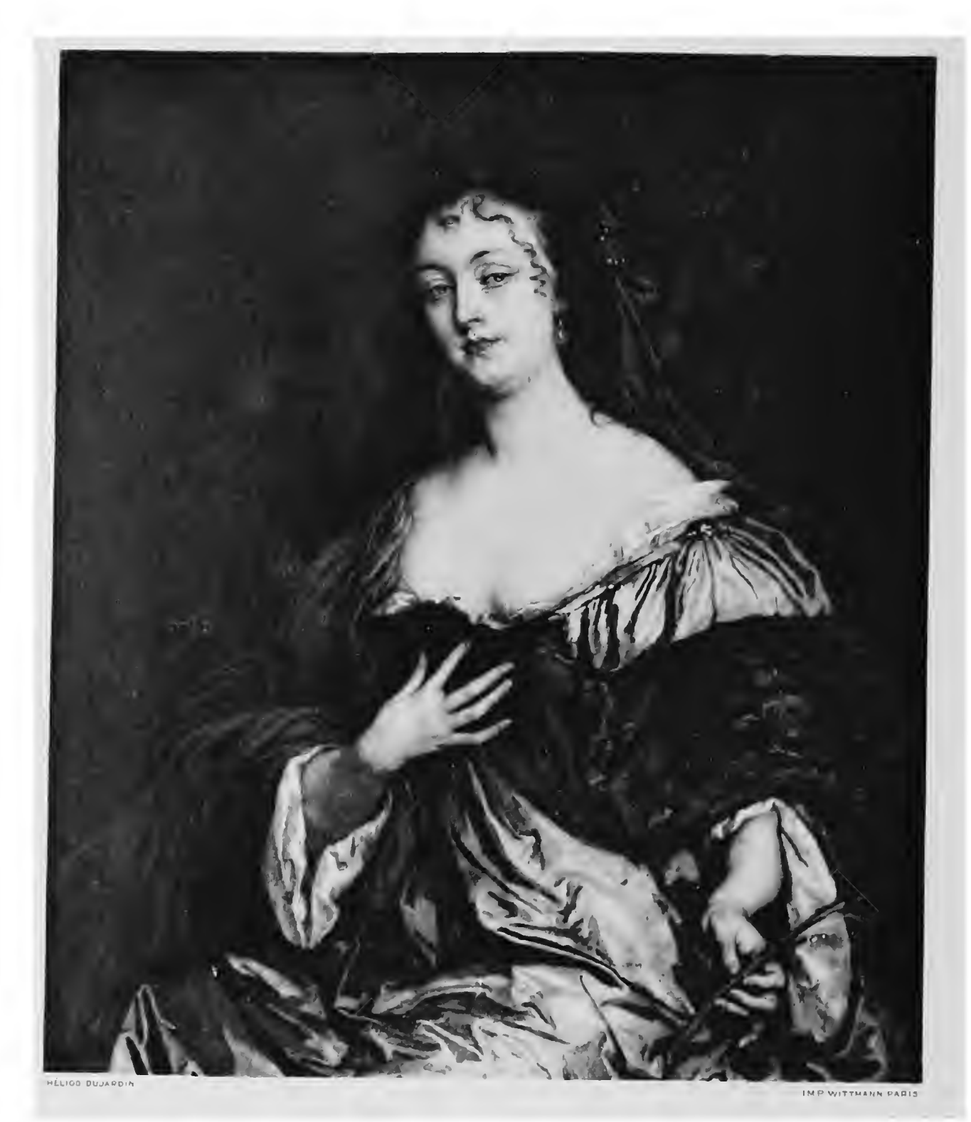
Stizabeth Hamilton Countries of Gramont. From the picture by Lely